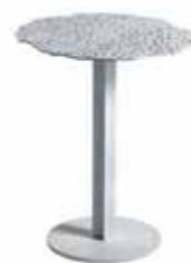
A TABLE FOR TWO P.11

2004 by Philippe Starck Monobloc easychair with fibercarbon shell in black colour. Indoor use only. W. 56 D. 65 H. 78; seat H. 45