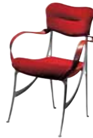
LUCAS P.4; 7

2009 by Oscar Tusquets Table. Cast iron structure painted in black anthracite colour. Round or square top in transparent th.12 mm float glass. Feet in black painted steel. Indoor use only. Ø 80; Ø 106, Ø 120 H.72 W. 80 D. 80, W. 100 D. 100, W. 120 D. 120 H. 72