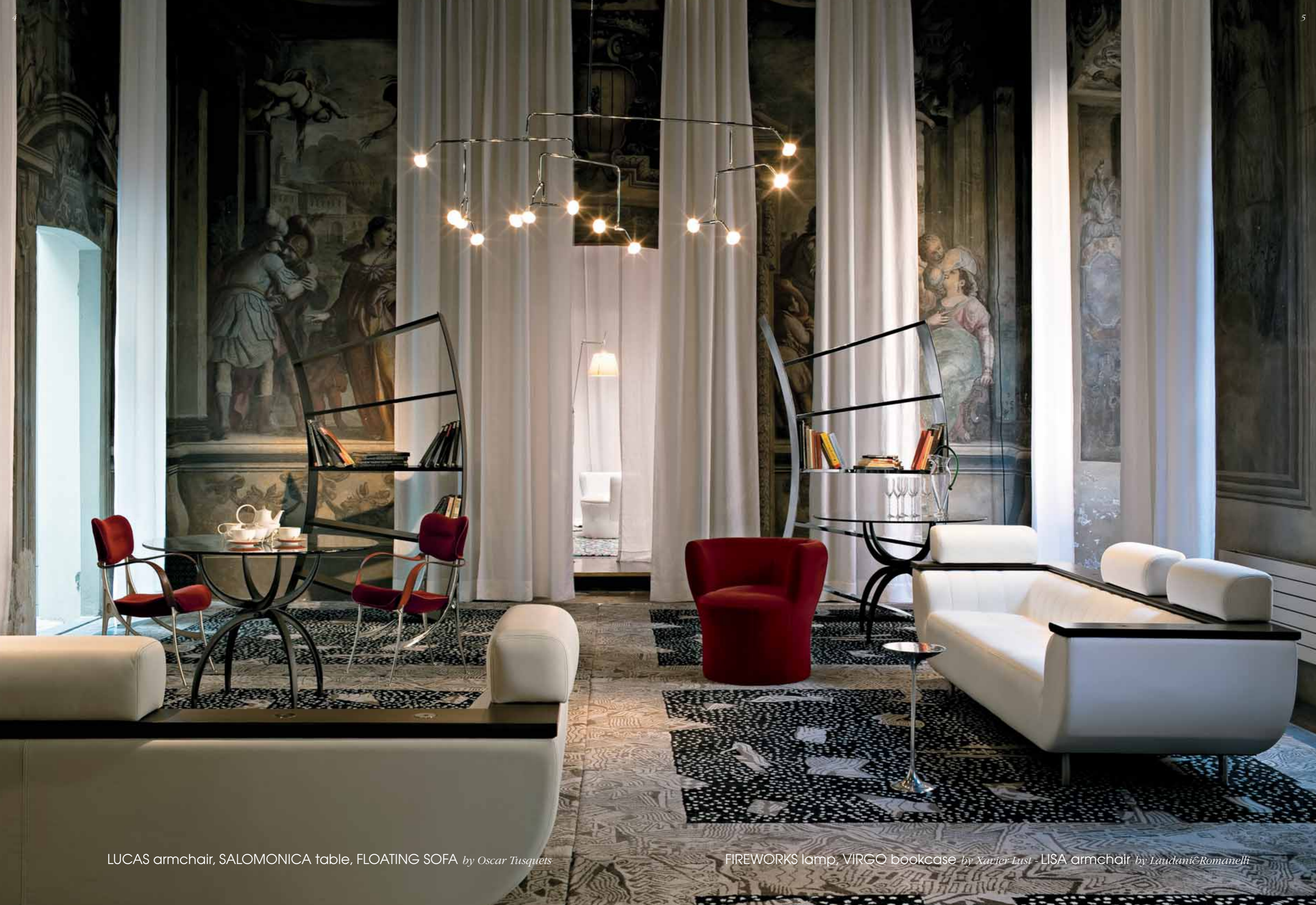
LUCAS armchair, SALOMONICA table, FLOATING SOFA by Oscar Tusquets