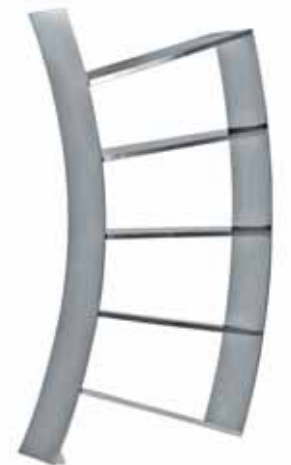
VIRGO P.1; 2; 4-5; 28

2009 by Xavier Lust Table. Base and top in die-casting polished aluminium. Indoor use only. Ø 70 H. 73