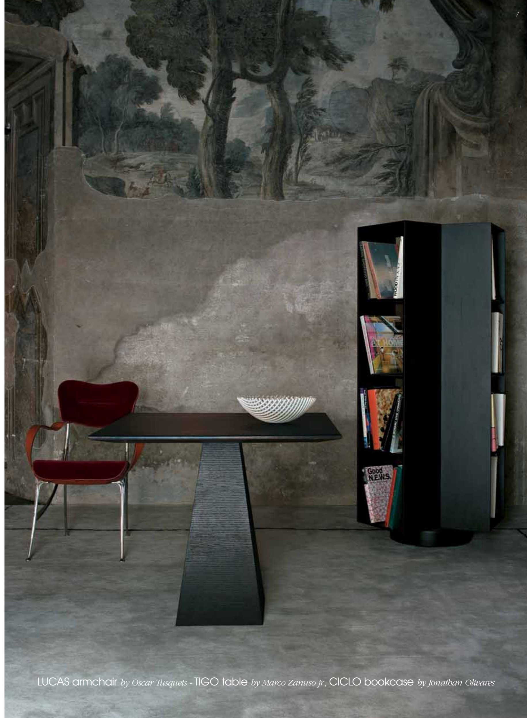
LUCAS armchair by Oscar Tusquets - TIGO table by Marco Zanuso jr., CICLO bookcase by Jonathan Olivares