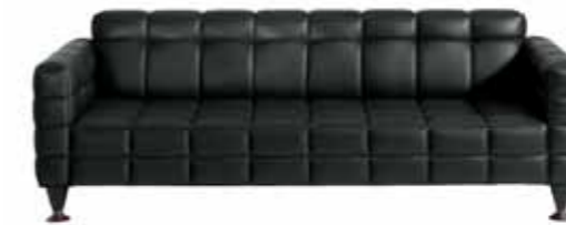
HOFF P.9; 10

2009 by Giuseppe Cbigiotti Small table on castors. Structure and shelves made of wooden conglomerate in ebonized teak finish. Indoor use only. W. 50 D. 80 H. 81