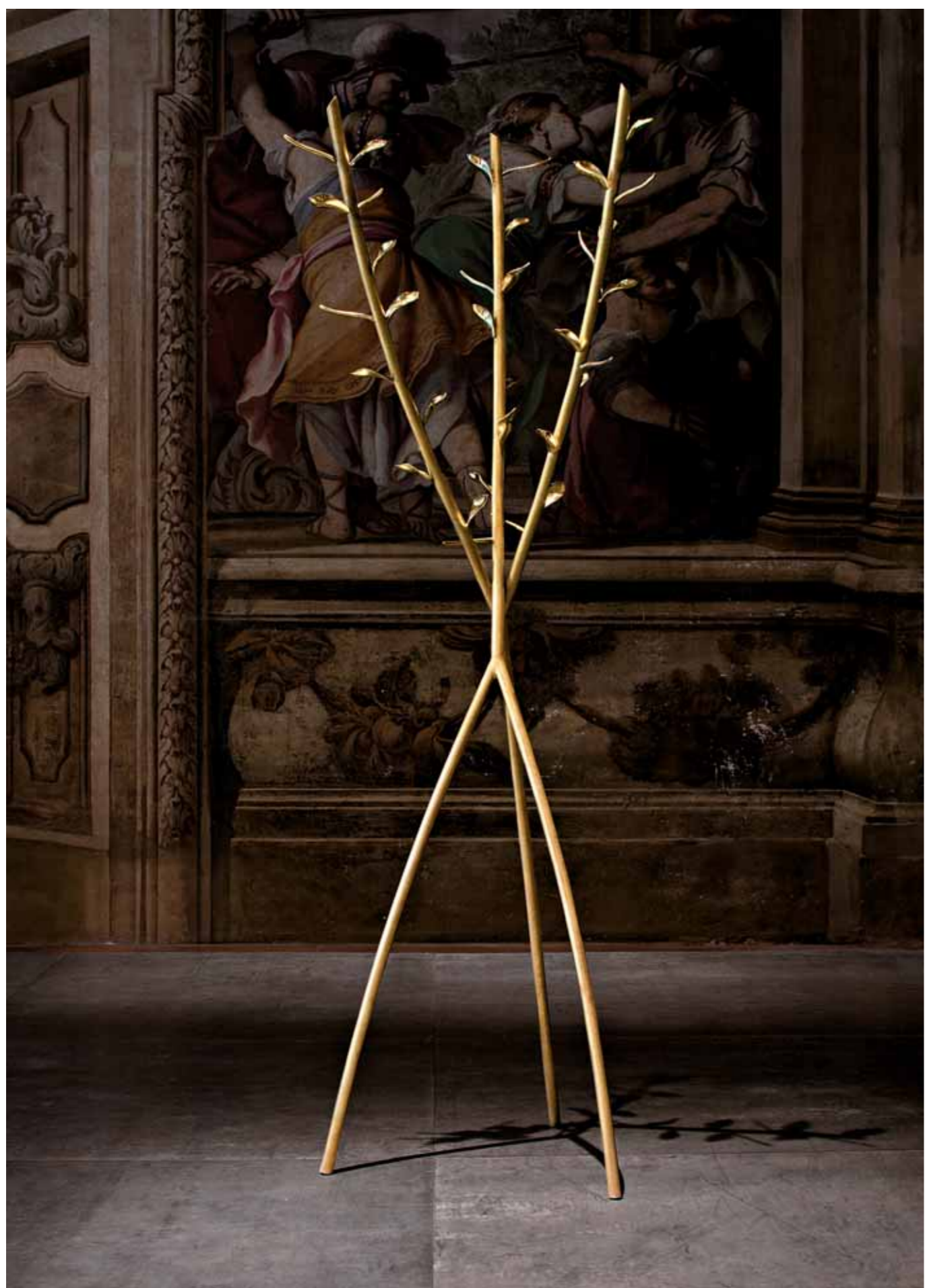
ACATE by Borek Sipek