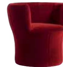
LISA P.1; 2; 5; 11; 28

2009 by Oscar Tusquets Armchair. Structure in polished stainless steel. Armrests in steel sheet covered with red leather. Padding seat and back covered with red Scala velvet. Indoor use only. W. 60 D. 56 H. 81; seat H. 47