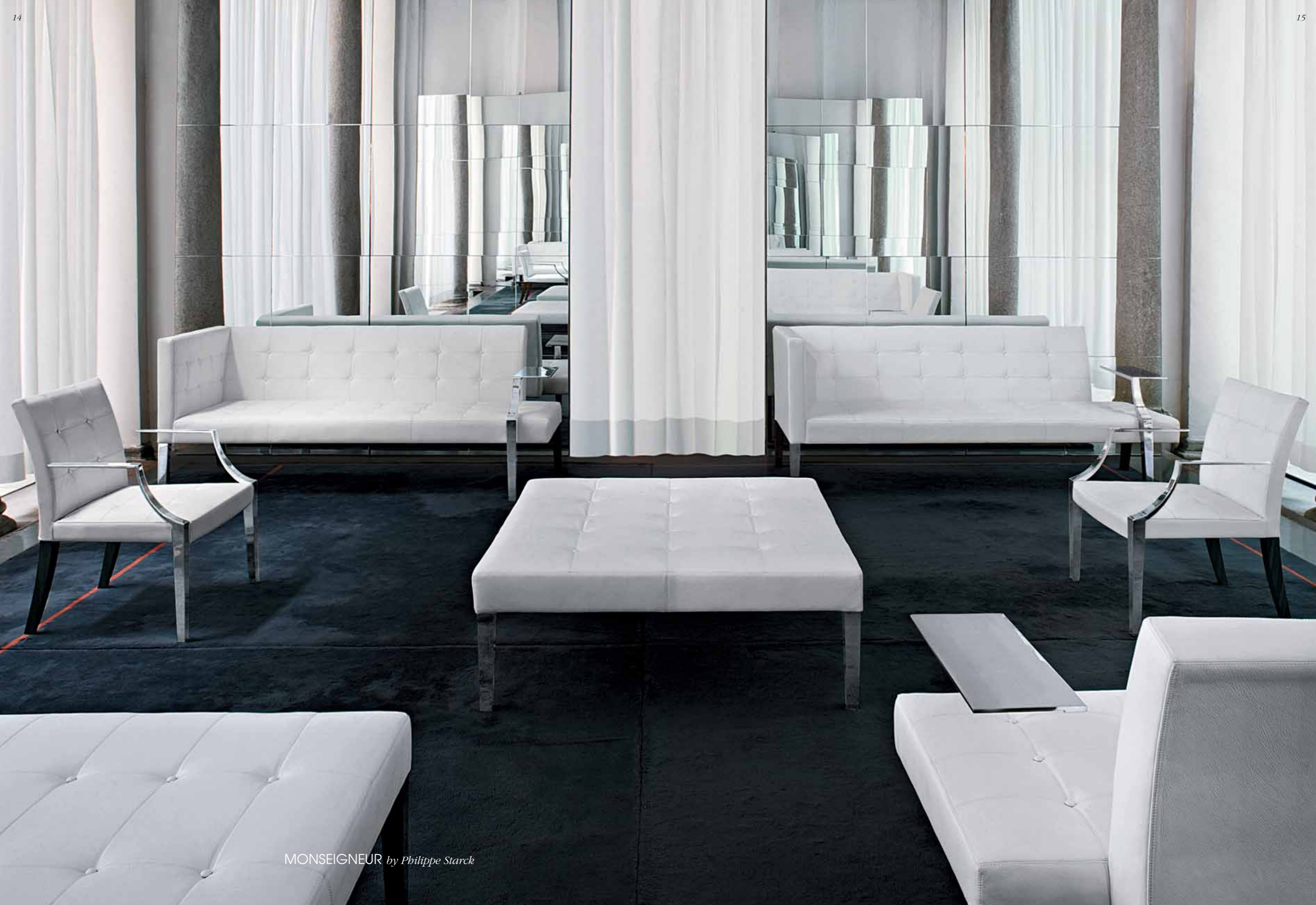
MONSEIGNEUR by Philippe Starck