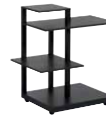
MAK P.9; 10