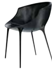
OSCAR BON P.8

2009 by Philippe Starck Armchair. Base in polished stainless steel casting and swivel white chair in fiberglass and covering in quilted full-grained Matisse white colour leather. Indoor use only. W. 99 D. 99 H. 96; seat H. 44,5