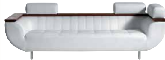
FLOATING SOFA P.4-5

2009 by Marco Zanuso Jr. Table. Base and top in wooden conglomerate with ebonized teak finish. Indoor use only. W. 85 D. 85 H. 73