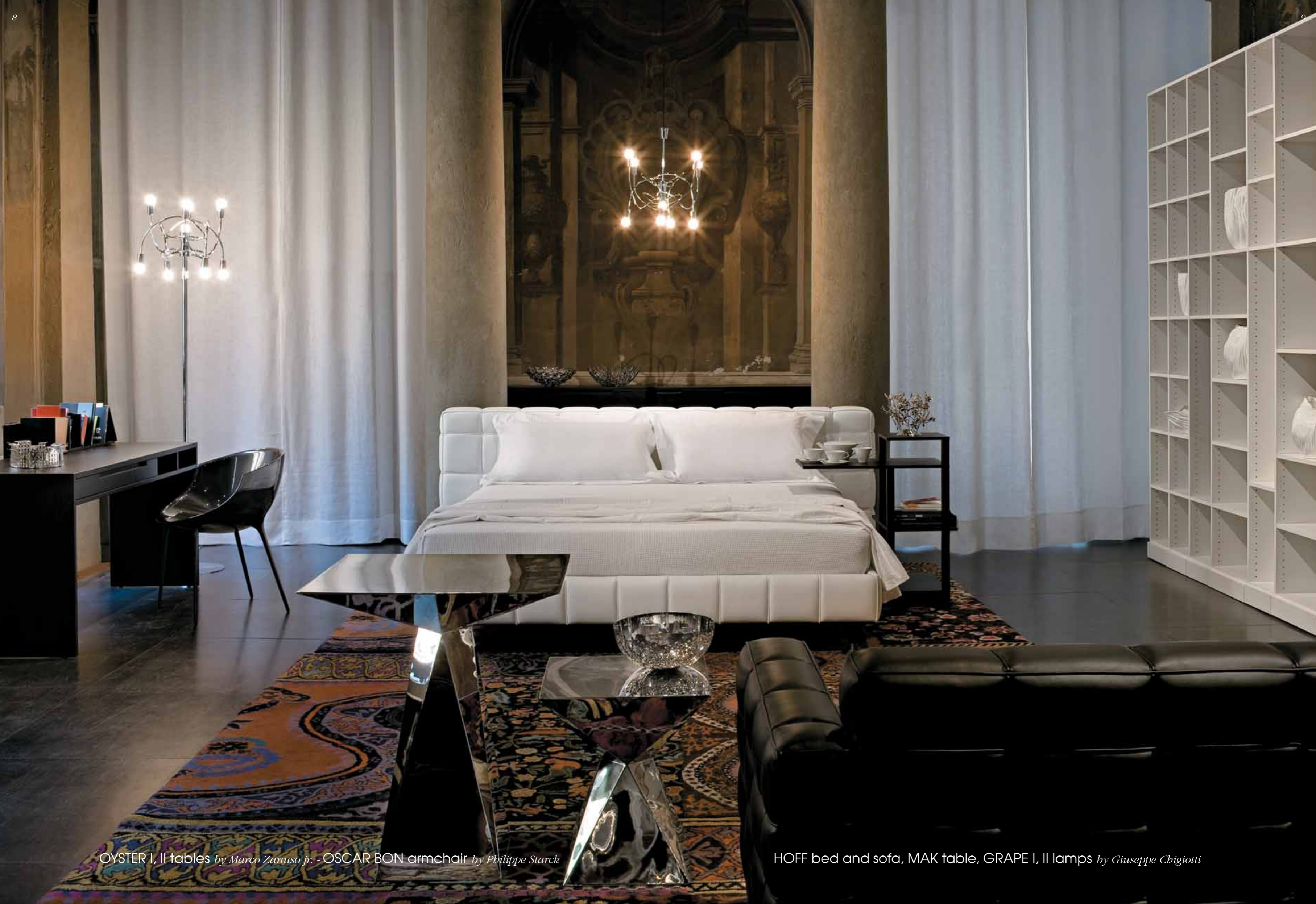
OYSTER I, II tables by Marco Zanuso jr. - OSCAR BON armchair by Philippe Starck