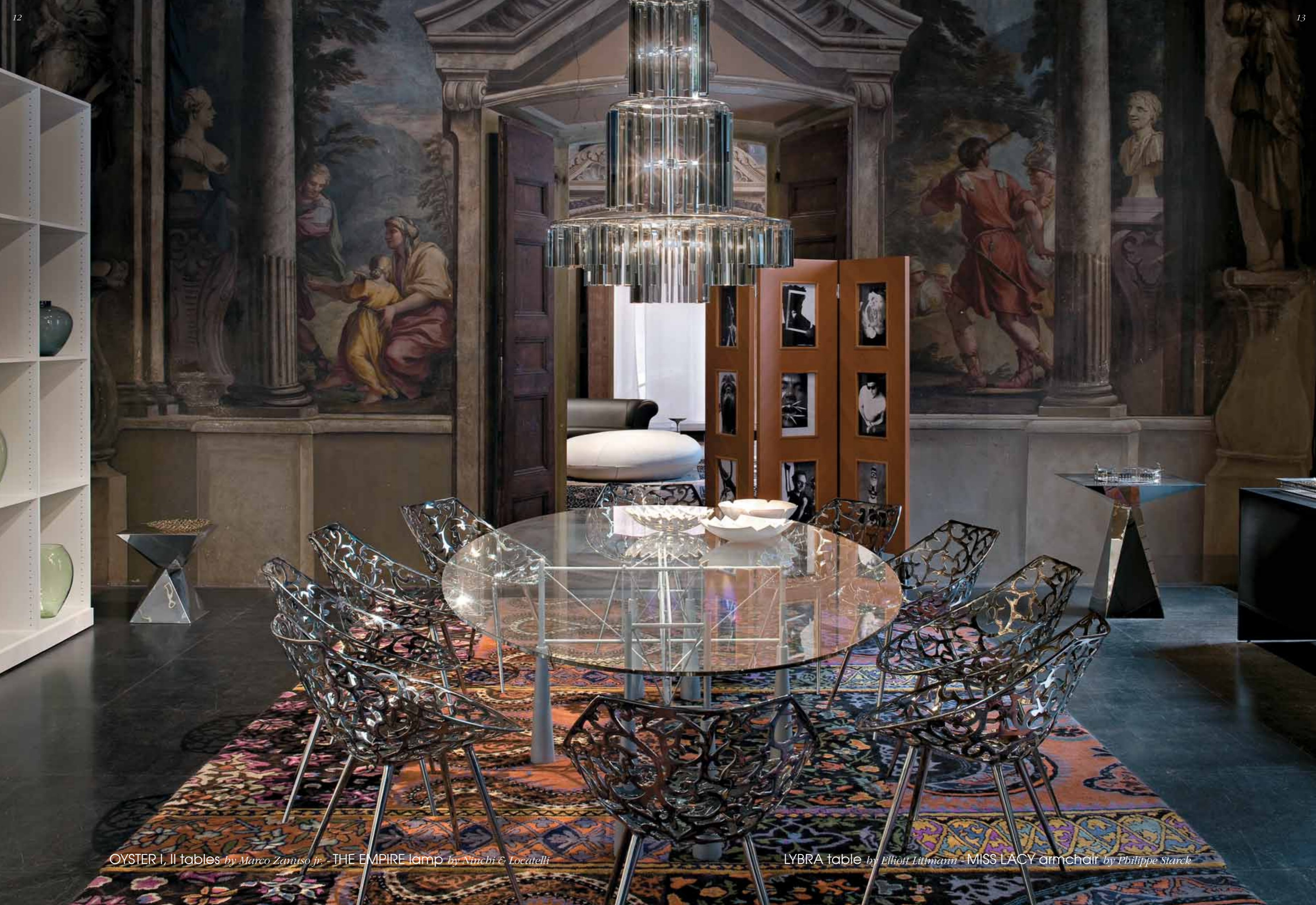
OYSTER I, II tables by Marco Zamuso jr. - THE EMPIRE lamp by Ninchi & Locatelli