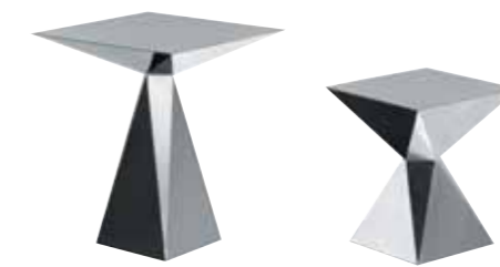
OYSTER I, II P.8-9; 12-13

2009 by Miki Astori Cabinet. Internal structure, equipped with shelves and drawer, in wooden conglomerate with ebonized teak finish. External shoulders and folders in ebonized aluminium silver colour. Feet height adjustable. Indoor use only. W. 71 D. 50,3 H. 210